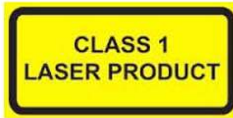
Figure 4. Class 1 laser product label

The VL53L5CX contains a laser emitter and corresponding drive circuitry. The laser output is designed to remain within Class 1 laser safety limits under all reasonable foreseeable conditions, including single faults, in compliance with the IEC 60825-1:2014 (third edition). The laser output remains within Class 1 limits as long as the STMicroelectronics recommended device settings are used and the operating conditions specified in the datasheet are respected. The laser output power must not be increased and no optics should be used with the intention of focusing the laser beam.