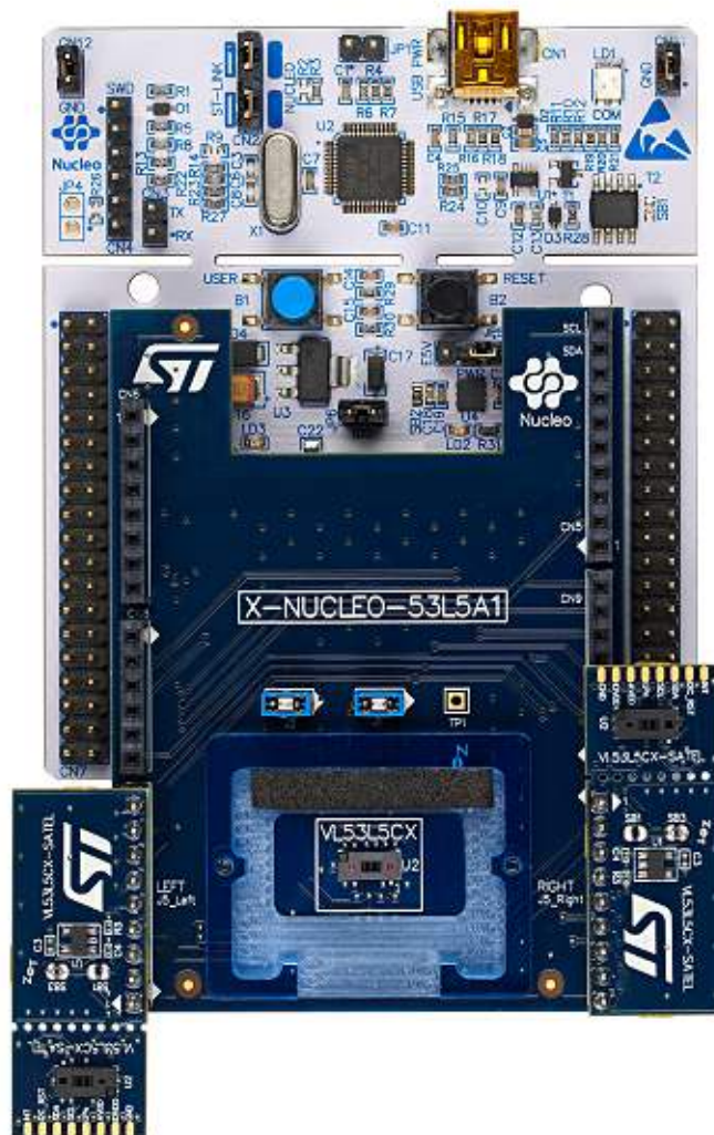
Figure 2. Connecting the VL53L5CX breakout boards

When connected through flying leads, developers should break off the mini PCB from the breakout board and use only the “VL53L5CX mini PCB” which is smaller and integrates more easily into the customer’s devices.