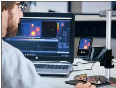
Connect over USB a computer to analyze data in FLIR Tools+