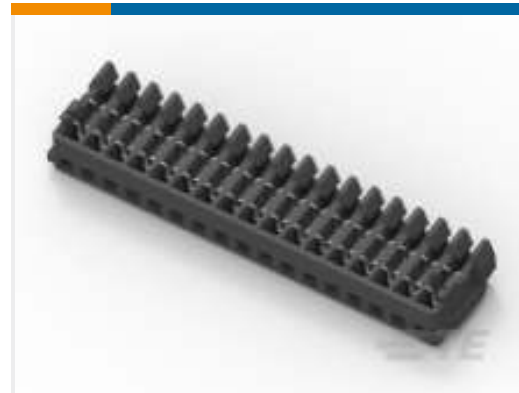
TE Part #3-353293-7 1.5MM CT MT REC ASSY 17P BLACK