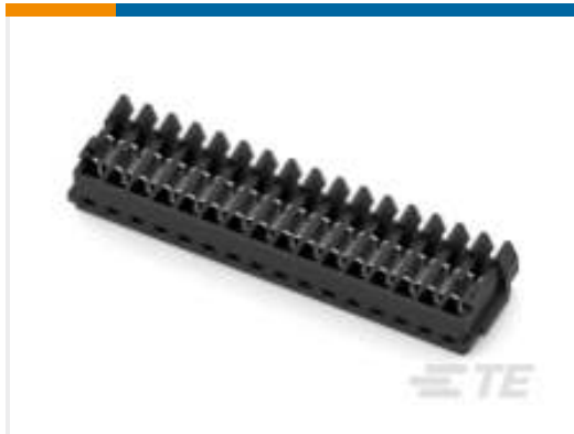
TE Part #3-353293-6 1.5MM CT MT REC ASSY 16P BLACK