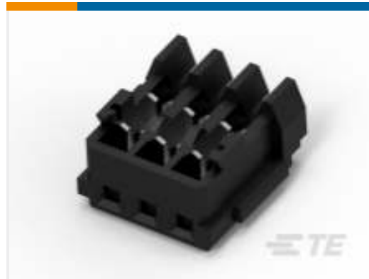
TE Part #2-353293-3 1.5MM CT MT REC ASS'Y 3P BLACK