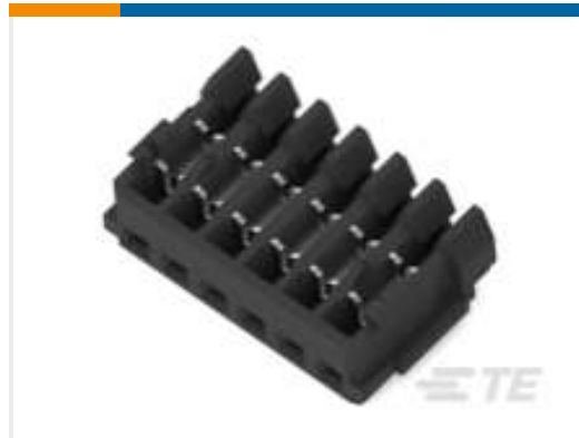
TE Part #2-353293-6 1.5MM CT MT REC ASS'Y 6P BLACK