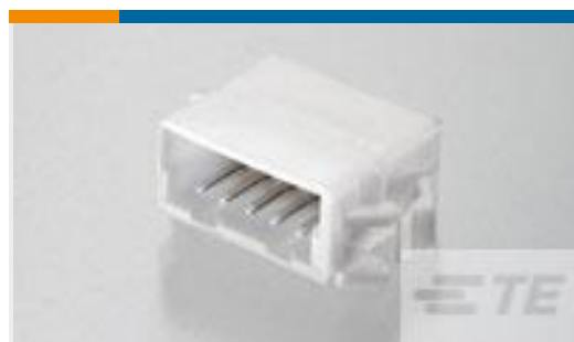
TE Part #2-292254-2 CT RELAY HDR ASSY 2P BLUE