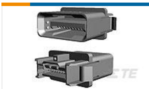
TE Part #1-1612257-4 REC ASSY 14P ,MINI CT DC DRAW