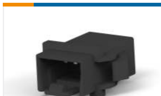
TE Part #2-292215-3 MINI CT SGL RELAY 3P BLACK