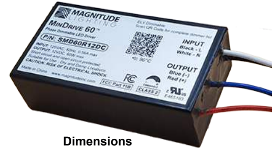
Dimensions 2.9" x 1.6" x 0.9"