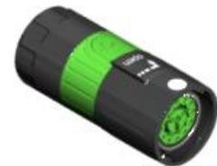
Contact Arrangement mating view

E ST B 002 NN 00 33 0001 000 E S B 002 N 00 33 0001 000