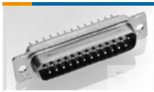
TE Part #1-1757823-0 AMPLIMITE, ASY, PLUG, STD, 90, ZN, 4, CT