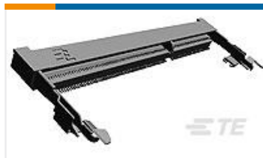
TE Part #2-2013310-1 EMBOSS TAPE DDR3 204P 9.2H STD