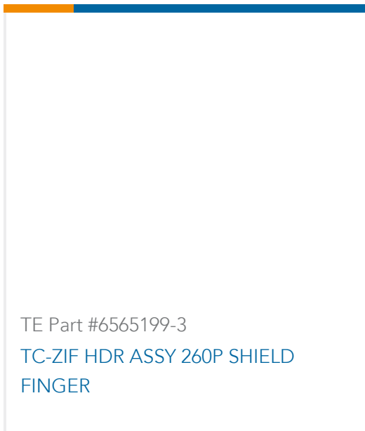
TE Part #6565199-3 TC-ZIF HDR ASSY 260P SHIELD FINGER