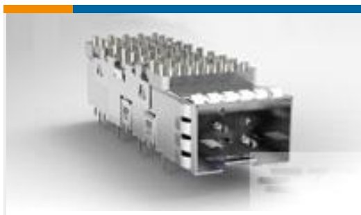
TE Part #2007193-1 SFP+ 1x1 Cage Assembly, PCI, S