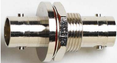
6744 BNC (F/F) Panel Mount Hermetically Sealed-75 Ω