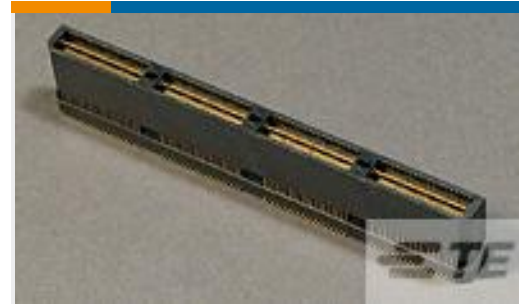
TE Part # 1-1658047-4 MSB0.80PL16ASY112DP,-,F,VCTY