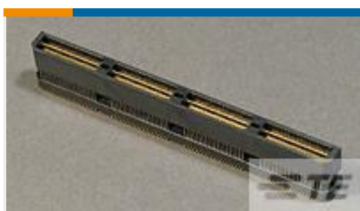
TE Part # 1-1658437-4 MSB0.80PL14ASY112DP,-,F,VCTY