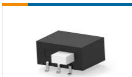
TE Part #1-1437581-1 ASE22RL=AUTOSLIDE DP