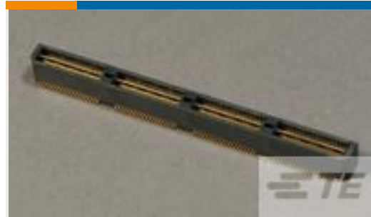
TE Part # 1-1658045-4 MSB0.80PL8ASY112DP,-,F,VCTY