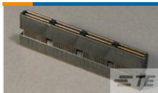
TE Part # 1-1658049-4 MSB0.80PL22ASY112DP,-,F,VCTY