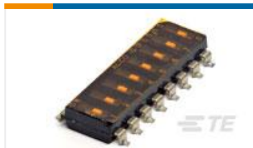
TE Part #1-1825006-9 GDS10S04=DIP SW,SLIDE,SMT