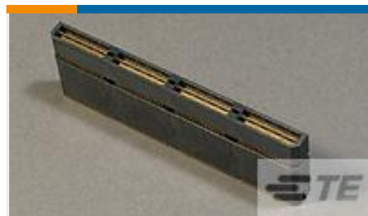
TE Part # 1-1658050-4 MSB0.80PL25ASY112DP,-,F,VCTY