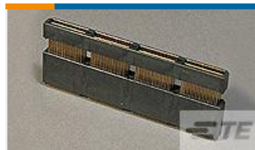
TE Part # 1-1658051-4 MSB0.80PL30ASY112DP,-,F,VCTY