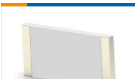
TE Part #7-2176246-6 CRGS2512 5% 1M8