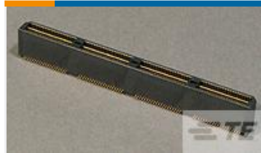
TE Part # 1-1658046-4 MSB0.80PL11ASY112DP,-,F,VCTY