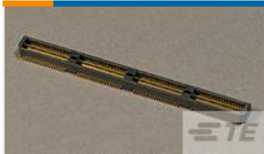
TE Part # 1-1658044-4 MSB0.80PL5ASY112DP,-,F,VCTY