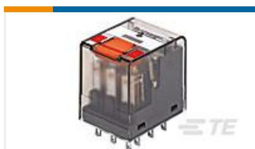
TE Part #3-1415020-1 PT570N20