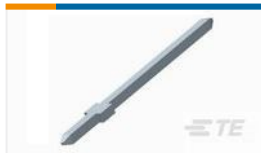
TE Part #1-928836-2 MOD2 PIN WITH A-PIN L/P