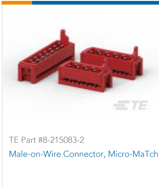
TE Part #8-215083-2 Male-on-Wire Connector, Micro-MaTch