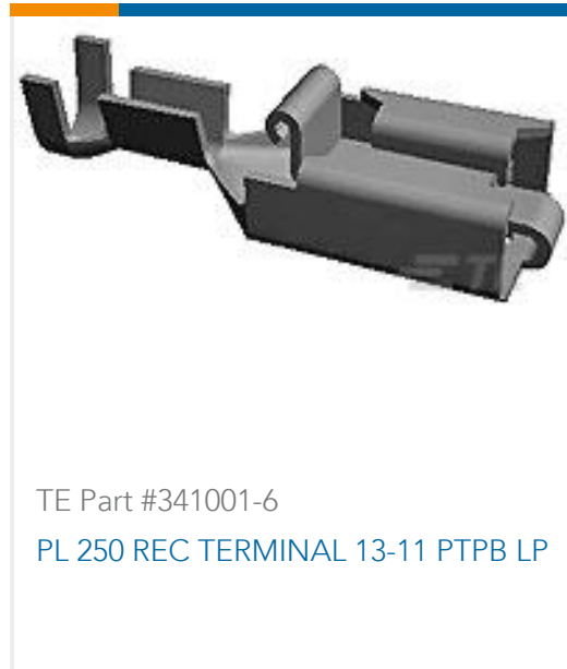
TE Part #341001-6 PL 250 REC TERMINAL 13-11 PTPB LP