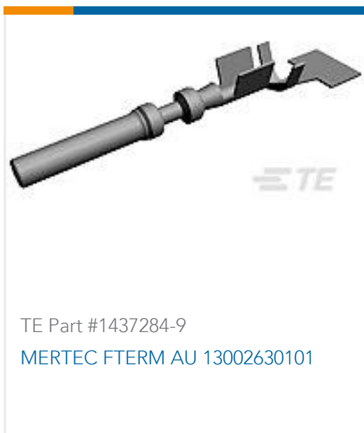
TE Part #1437284-9 MERTEC FTERM AU 13002630101