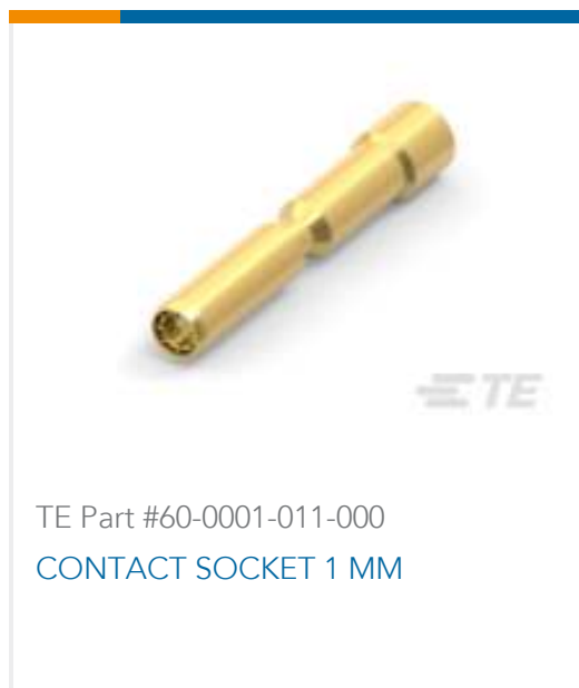
TE Part #60-0001-011-000 CONTACT SOCKET 1 MM