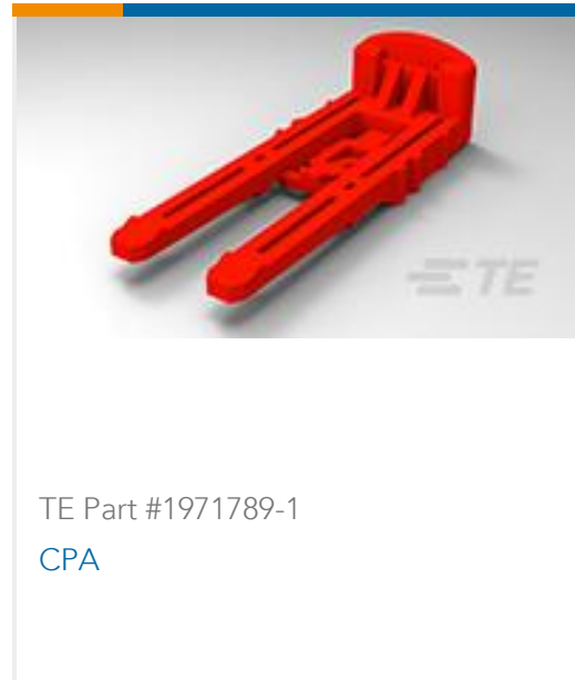
TE Part #1971789-1 CPA