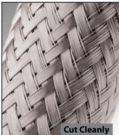
Cut Cleanly Shears