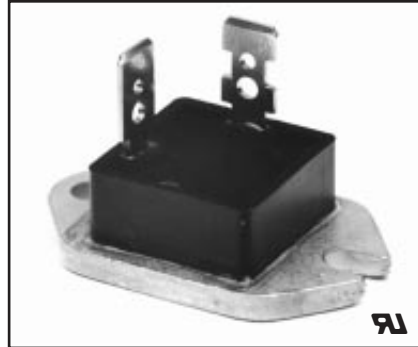
CS340602, CS341202 Fast Recovery Single Diode Modules 20 Amperes/600-1200 Volts