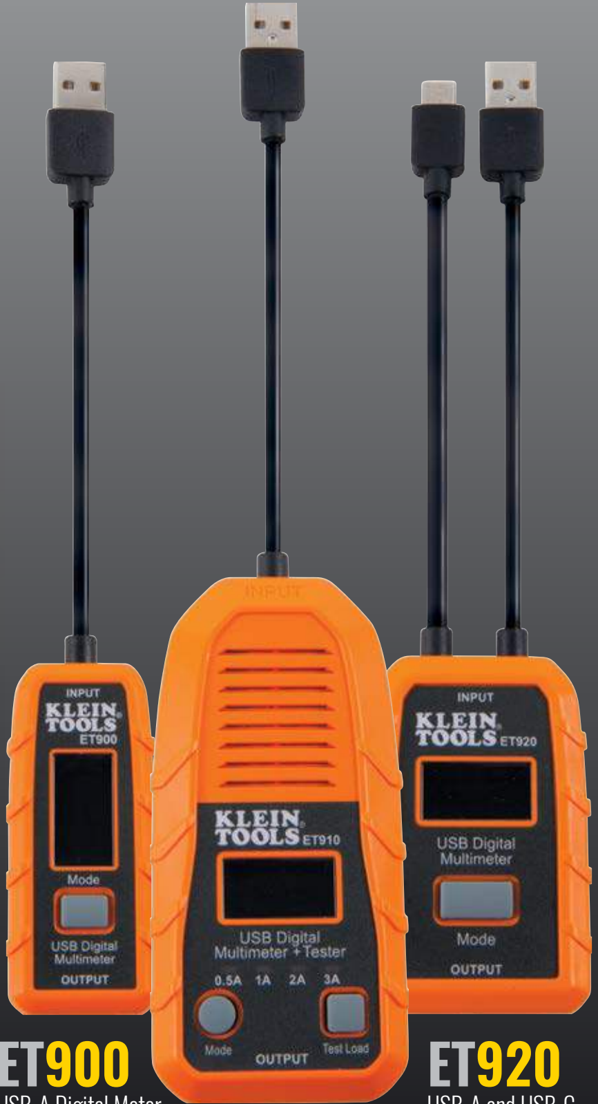
ET900 USB-A Digital Meter