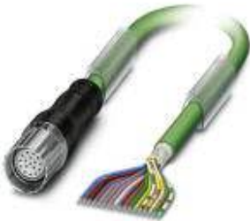
Cable plug in molded plastic, Length: 5 m, Color of outer sheath: green

Please be informed that the data shown in this PDF Document is generated from our Online Catalog. Please find the complete data in the user's documentation. Our General Terms of Use for Downloads are valid ( http://phoenixcontact.com/download )