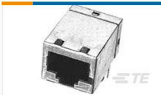
TE Part #5557789-1 MJ,8POS,R/A,SHORTNG,PCBG