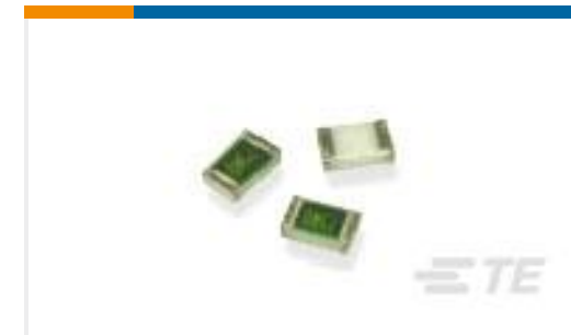
TE Part #8-2176089-8 RP 1J 0.166W 95K3 0.1% 25PPM 1K RL