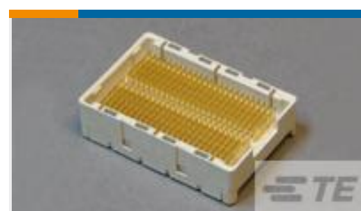
TE Part # 6-1761616-0 STEP-Z PLUG 10MM 296P LF ST