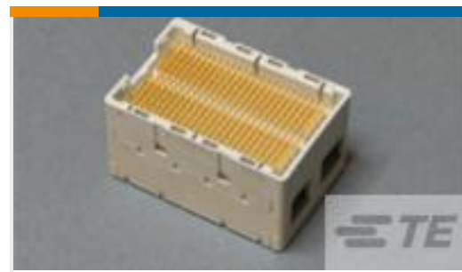
TE Part # 7-1761616-0 STEP-Z PLUG 20MM 296P LF ST