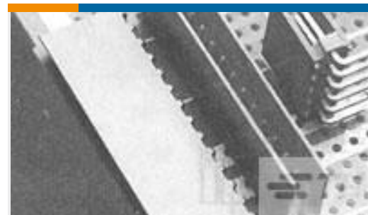
TE Part #281696-2 HEADER HE13 STRAIGHT 2 P