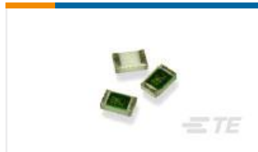
TE Part #5-1879215-7 CPF 0402 17K4 0.1% 25PPM 1K RL