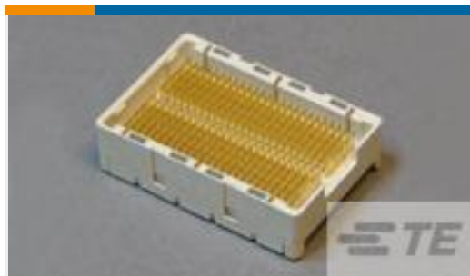
TE Part #6-1761612-0 STEP-Z PLUG 10MM 104P LF ST