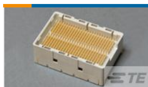
TE Part # 6-1761616-3 STEP-Z PLUG 13MM 296P LF ST