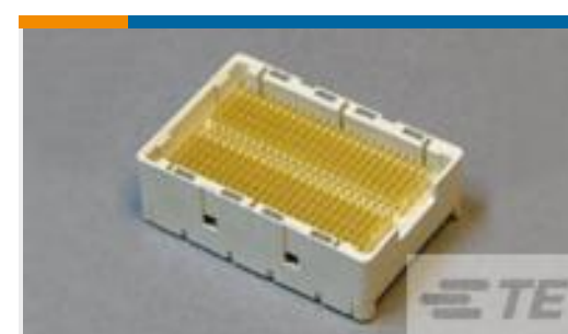
TE Part # 6-1761616-2 STEP-Z PLUG 12MM 296P LF ST