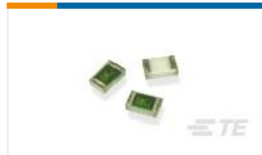
TE Part #5-2176089-3 RP 1J 0.166W 39K2 0.1% 25PPM 1K RL