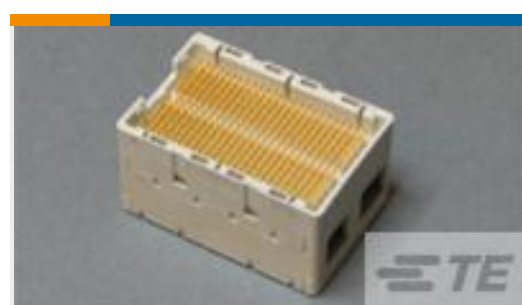
TE Part # 7-1761616-5 STEP-Z PLUG 25MM 296P LF ST