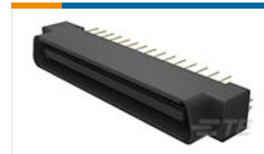
TE Part #5175473-3 CHAMP 050 BTB PLUG V 30P W/LEG