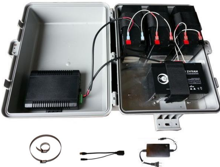
UPSPRO® Polycarbonate Enclosure System