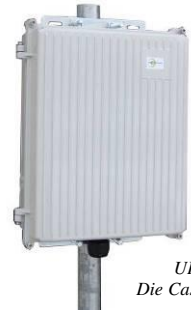
UPSPro ® Die Cast Enclosure