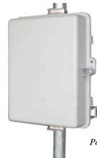
UPSPro ® Polycarbonate Enclosure