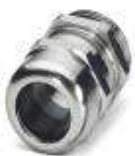
Cable gland, Cable gland material: Brass, nickel-plated, External cable diameter 11 mm ... 17 mm, Shielding: No, Connecting thread: M25, Color: silver

Cable gland - G-INS-M25-M68N-NNES-S - 1411165