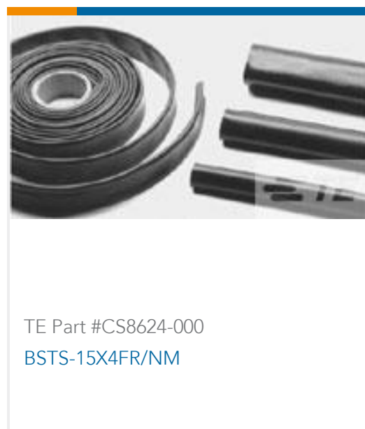
TE Part #CS8624-000 BSTS-15X4FR/NM