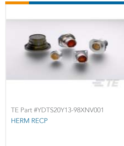
TE Part #YDTS20Y13-98XNV001 HERM RECP