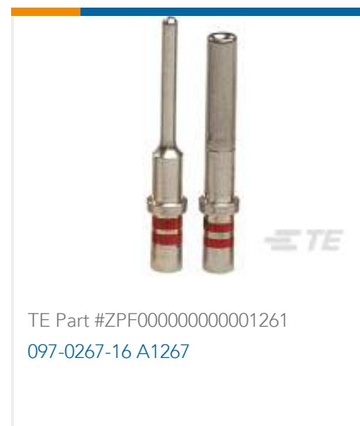
TE Part #ZPF000000000001261 097-0267-16 A1267