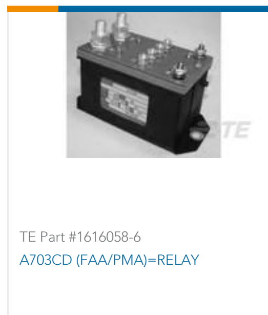
TE Part #1616058-6 A703CD (FAA/PMA)=RELAY