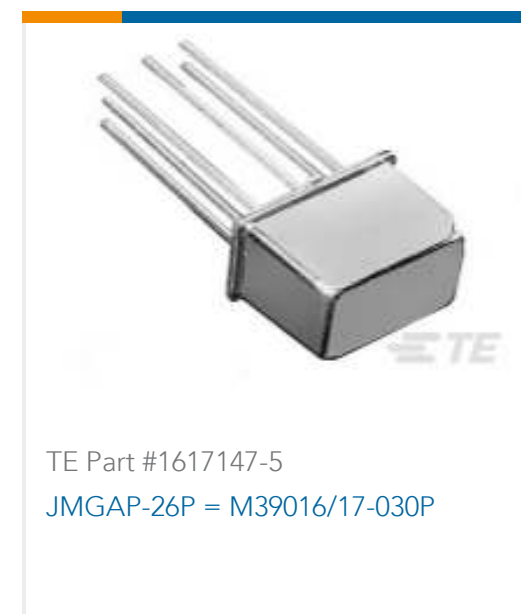
TE Part #1617147-5 JMGAP-26P = M39016/17-030P