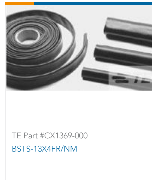
TE Part #CX1369-000 BSTS-13X4FR/NM