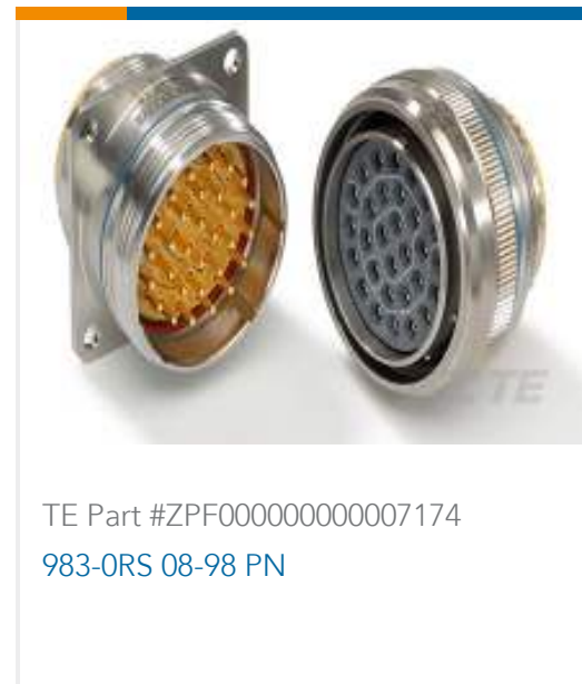
TE Part #ZPF000000000007174 983-ORS 08-98 PN