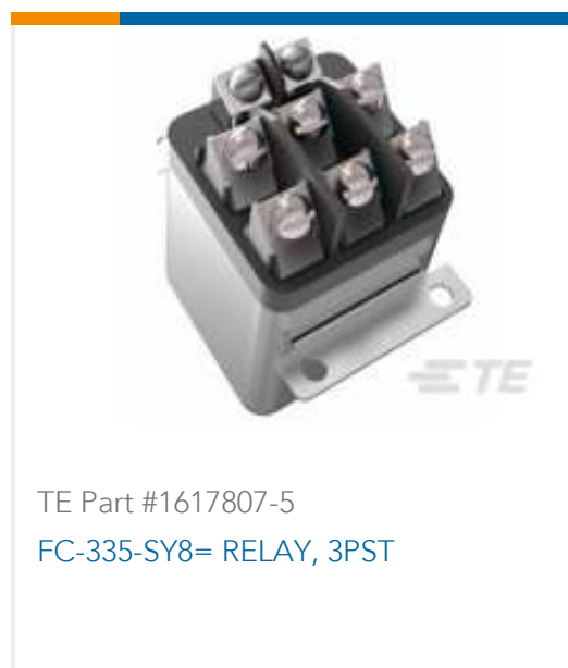
TE Part #1617807-5 FC-335-SY8= RELAY, 3PST