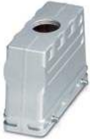
HEAVYCON sleeve housing B24, for double locking latch, height 76 mm, with thread M40, straight cable outlet, EMC version

Please be informed that the data shown in this PDF Document is generated from our Online Catalog. Please find the complete data in the user's documentation. Our General Terms of Use for Downloads are valid ( http://download.phoenixcontact.com )