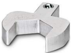
Special wrench, series: RF

https://www.phoenixcontact.com/us/products/1614347