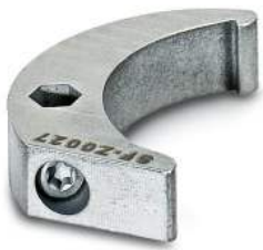
Hook wrench, series: RC

https://www.phoenixcontact.com/us/products/1607455