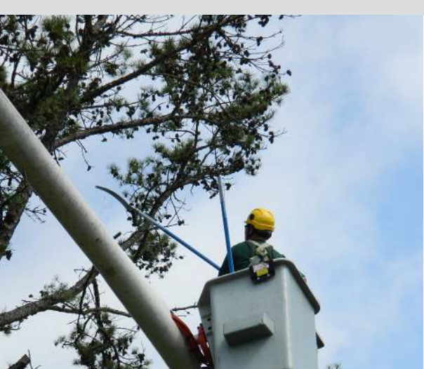
Snap Onto Pole to Reach Out-Of-The-Way Limbs