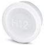
Plastic dust protection cap

Plastic dust protection cap - ST-Z0006 - 1607776