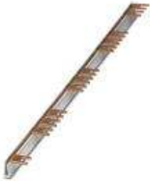
Wiring bridge for modules with connecting pitch 17.5 mm, 1-phase, 20 pitches with contact sequence 1-2-0-0-5

Please be informed that the data shown in this PDF Document is generated from our Online Catalog. Please find the complete data in the user's documentation. Our General Terms of Use for Downloads are valid ( http://phoenixcontact.com/download )