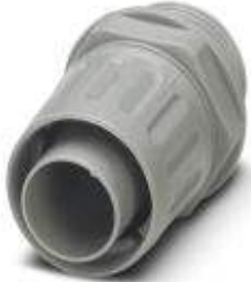
Cable gland made from PP with metric thread, rotatable, IP54 protection

Please be informed that the data shown in this PDF Document is generated from our Online Catalog. Please find the complete data in the user's documentation. Our General Terms of Use for Downloads are valid ( http://phoenixcontact.com/download )