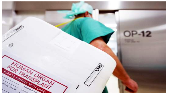
Blood & Organ Transport