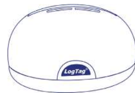
LTI-HID Not Included