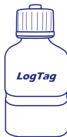
Glycol Buffer Not Included