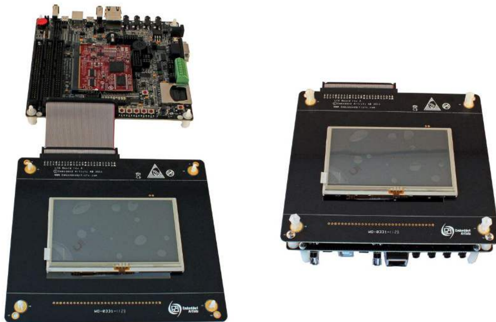
Figure 1 – LCD Board Mounting Options