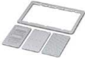
Magazine insert, for CMS-WMU, accepts: 9 Zack strip conductor marking collars

Please be informed that the data shown in this PDF Document is generated from our Online Catalog. Please find the complete data in the user's documentation. Our General Terms of Use for Downloads are valid ( http://phoenixcontact.com/download )