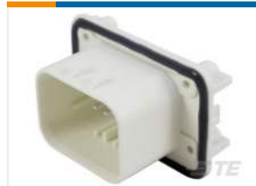
TE Part #776267-2 14POS,PIN DIA 1.3,HDR ASSY,90DEG, COD 2