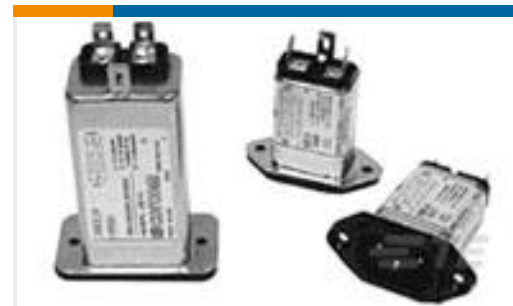
TE Part #1-6609006-1 6EEJP=F8016 S0