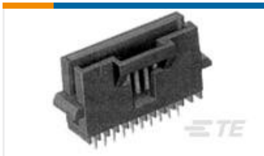
TE Part #5-104071-4 20 SYSTEM 50 HDR SRST SHRD SN