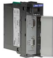
Communication Module 112016-0018 (SST-PB3-CLX-RLL)