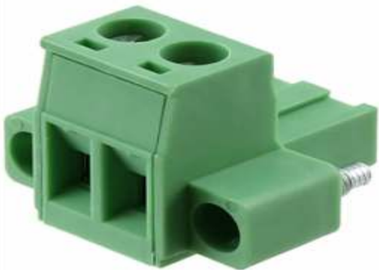
Mates with 1924525, 1924088