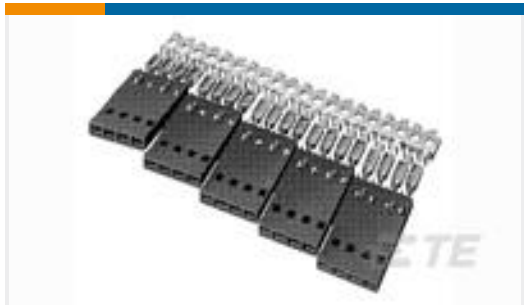
TE Part # 5-103973-9 2X10 MTE RCPT SR RIBBED .100CL