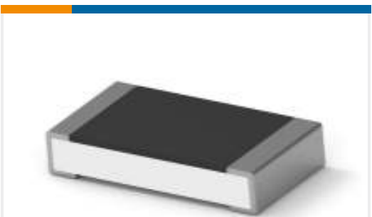
TE Part #3-2176389-0 RQ 1206 215R 0.1% 10PPM 5K RL