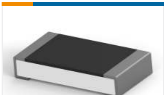
TE Part #1-2176392-2 RQ 1206 174K 0.1% 10PPM 5K RL