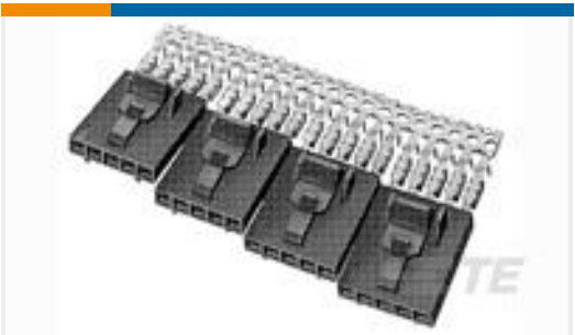
TE Part # 103958-9 2X10 MTE RCPT SR LATCH .100CL