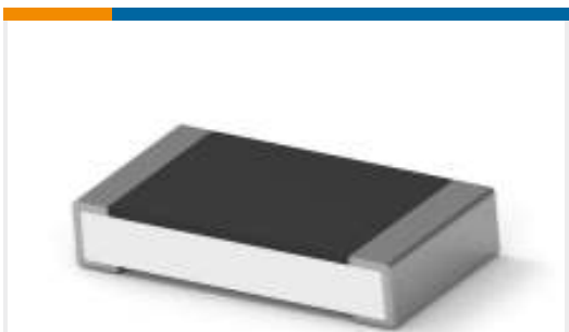
TE Part #2-2176389-4 RQ 1206 187R 0.1% 10PPM 5K RL