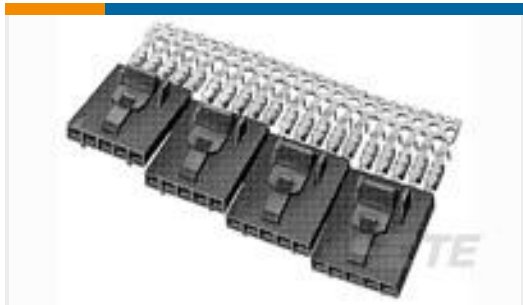
TE Part # 5-103961-9 2X10 MTE RCPT SR LATCH .100CL