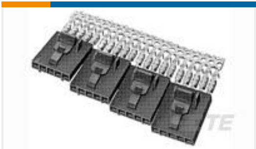
TE Part # 5-103958-9 2X10 MTE RCPT SR LATCH .100CL