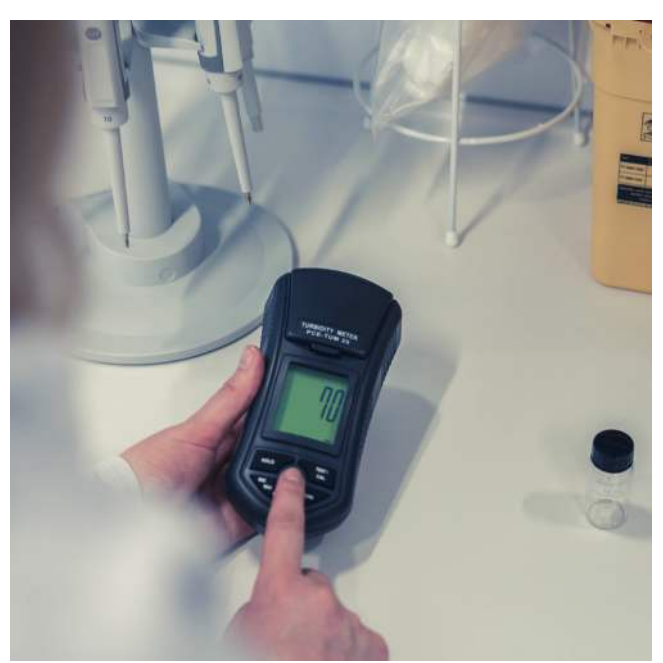
PCE-TUM 20 Turbidity Meter

0 ... 1000 NTU turbidity measuring range / Infrared LED light source / Calibration references included