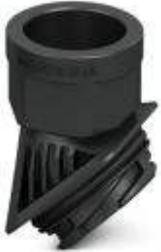
EVO plastic adapter with bayonet locking, for EVO housing series D, for Pg16 screw connections.

Please be informed that the data shown in this PDF Document is generated from our Online Catalog. Please find the complete data in the user's documentation. Our General Terms of Use for Downloads are valid ( http://phoenixcontact.com/download )