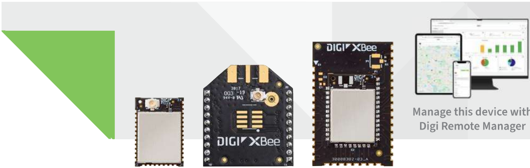
Manage this device with Digi Remote Manager