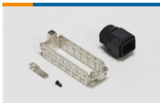
Rectangular Connector Hardware(19)