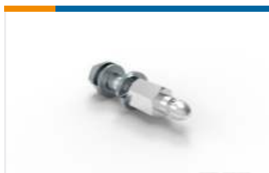
TE Part #1-2308290-1 QL-SET FOR VARIAN C VW REAR WALL MOUNTG