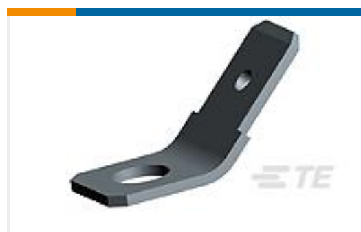
TE Part #140814-1 250 FASTON,TAB,BR