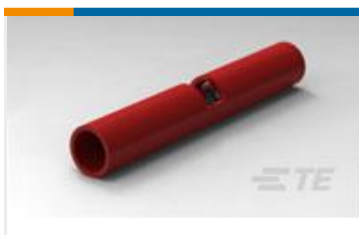
TE Part #320559 PIDG SPLICE 22-16COMM 22-18MIL