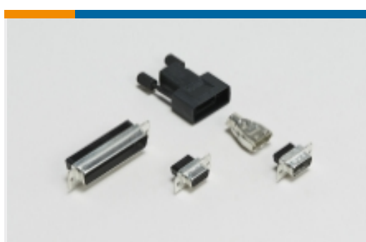
Crimp D-Sub Connectors(10)