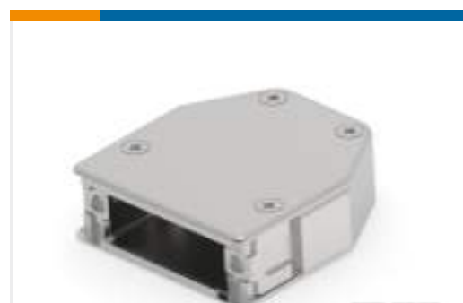
TE Part #1-2308321-1 FULL METAL HOODS SIZE 2, (1)