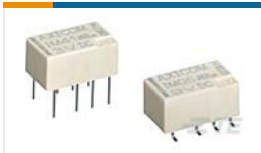
TE Part #6-1462037-4 IM45GR=IM RELAY 100mW 9V BIS