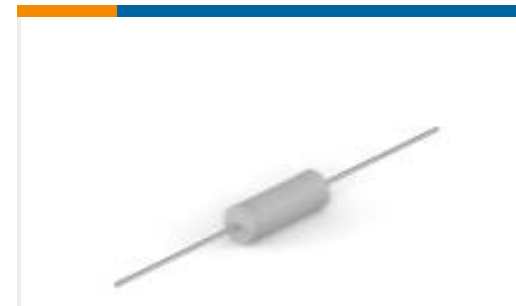
TE Part #2176412-8 5W XSM M/OX 5% 10R