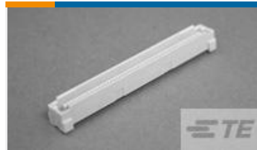
TE Part #1-5177986-1 0.8FH,P06H.5,040,08/Sn,TR,SC