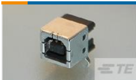
TE Part #292304-2 STD USB TYPE B, R/A, T/H