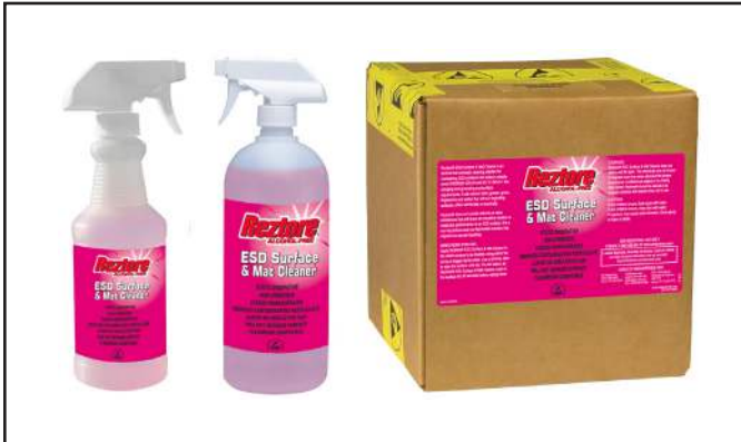
Figure 1. Reztore® Alcohol-Free ESD Surface & Mat Cleaner: 16 Ounces (450 ml) Spray Bottle 1 Quart (950 ml) Spray Bottle 2.5 Gallons (10 liters) Bag-in-Box