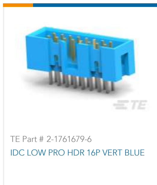
TE Part # 2-1761679-6 IDC LOW PRO HDR 16P VERT BLUE