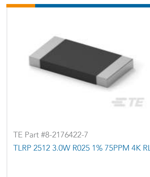
TE Part #8-2176422-7 TLRP 2512 3.0W R025 1% 75PPM 4K RL