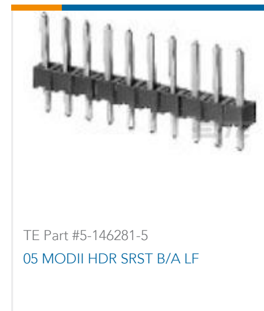
TE Part #5-146281-5 05 MODII HDR SRST B/A LF