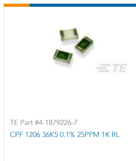
TE Part #4-1879226-7 CPF 1206 36K5 0.1% 25PPM 1K RL