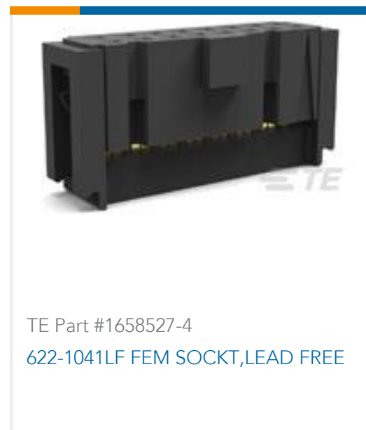
TE Part #1658527-4 622-1041LF FEM SOCKET, LEAD FREE