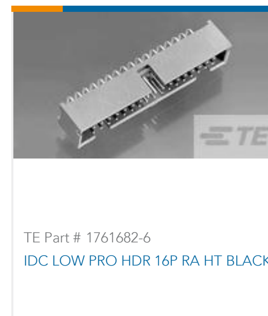
TE Part # 1761682-6 IDC LOW PRO HDR 16P RA HT BLACK