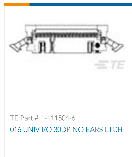
TE Part # 1-111504-6 016 UNIV I/O 30DP NO EARS LTCH