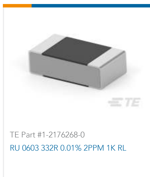
TE Part #1-2176268-0 RU 0603 332R 0.01% 2PPM 1K RL