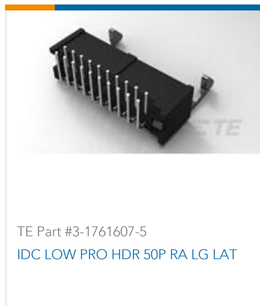
TE Part #3-1761607-5 IDC LOW PRO HDR 50P RA LG LAT