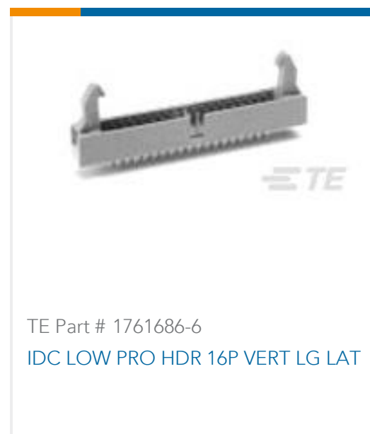
TE Part # 1761686-6 IDC LOW PRO HDR 16P VERT LG LAT