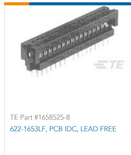
TE Part #1658525-8 622-1653LF, PCB IDC, LEAD FREE