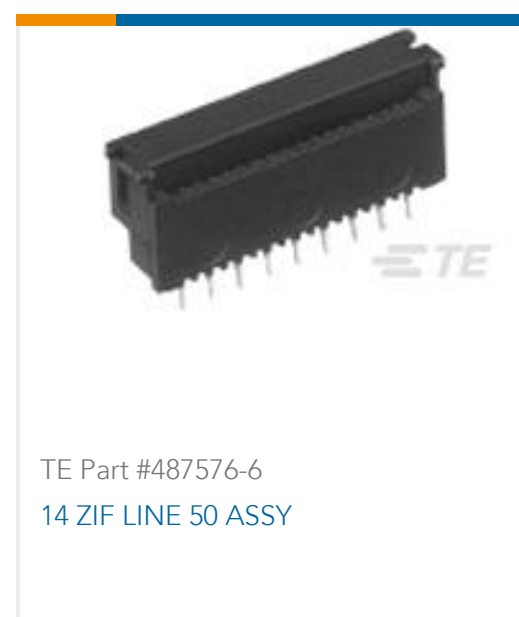
TE Part #487576-6 14 ZIF LINE 50 ASSY