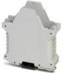
Component housing without vents, Lower part, Cross connection: DIN rail bus connector, Color: light gray, Width: 35 mm, Constructional height: 114.5 mm, Number of positions cross connector: 5

Please be informed that the data shown in this PDF Document is generated from our Online Catalog. Please find the complete data in the user's documentation. Our General Terms of Use for Downloads are valid ( http://phoenixcontact.com/download )