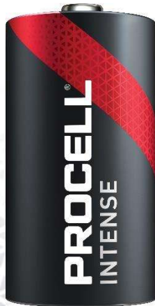
Size: D (LR20) PX1300