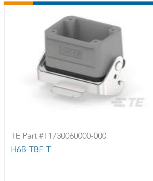
TE Part #T1730060000-000 H6B-TBF-T