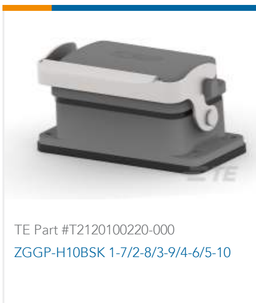
TE Part #T2120100220-000 ZGGP-H10BSK 1-7/2-8/3-9/4-6/5-10