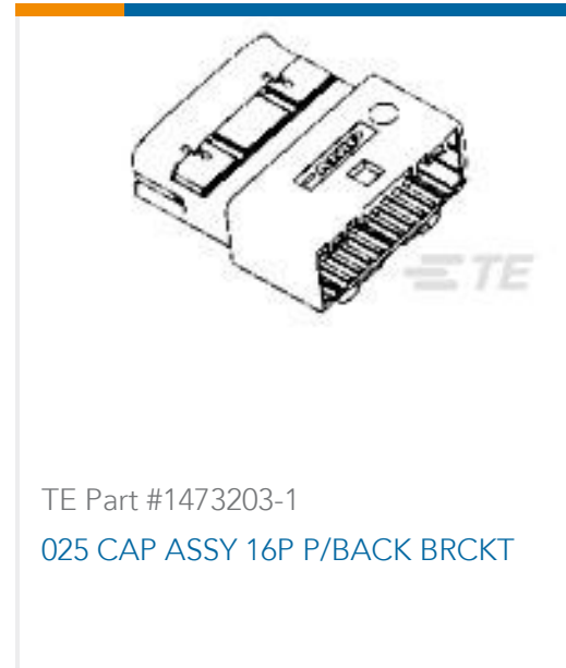
TE Part #1473203-1 025 CAP ASSY 16P P/BACK BRCKT