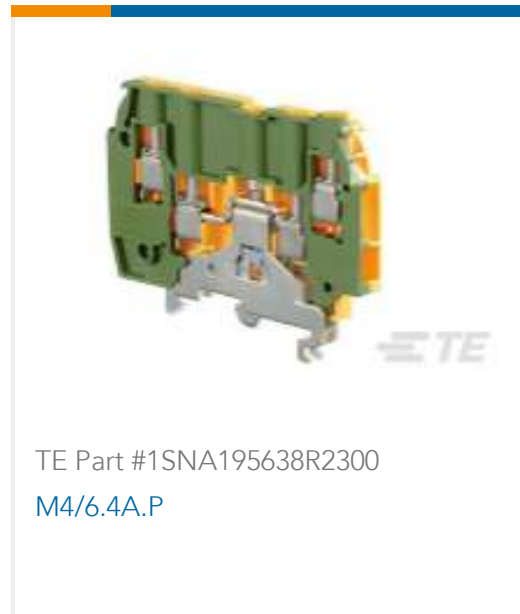
TE Part #1SNA195638R2300 M4/6.4A.P