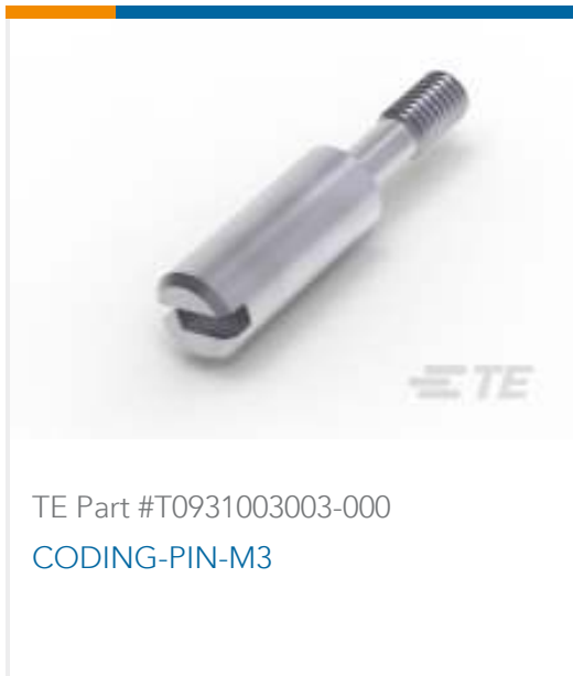
TE Part #T0931003003-000 CODING-PIN-M3