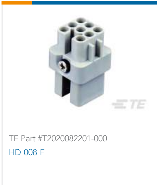
TE Part #T2020082201-000 HD-008-F