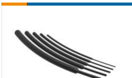
TE Part #NB18742001 RNF-100-1/16-BK-STK