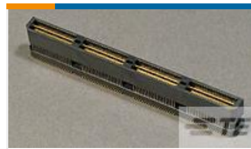
TE Part # 1658437-4 MSB0.80PL14ASY160FL,-,F,-TY