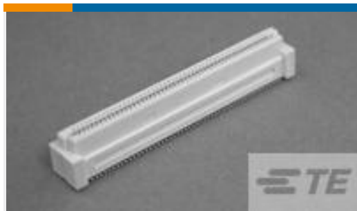
TE Part #5-5179180-6 0.8FH,R09H.5,140,08/Sn,TR,SC