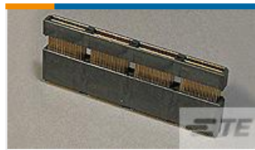
TE Part # 1658051-4 MSB0.80PL30ASY160FL,-,F,-TY