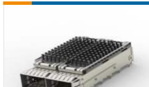
TE Part #2170806-2 CAGE ASSEMBLY, 1X2, QSFP28, SPRING, HS