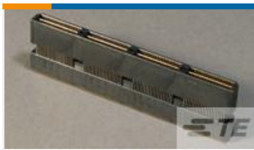
TE Part # 1658049-4 MSB0.80PL22ASY160FL,-,F,-TY