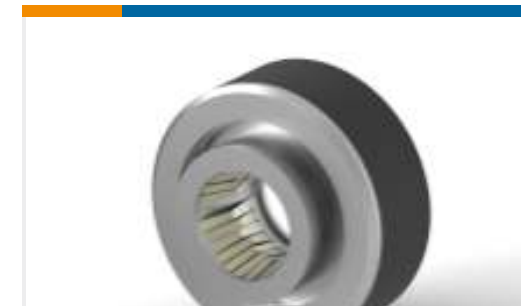
TE Part #2361483-1 ICCON INSERT SIZE 8.0mm SOCKET FLOAT SMT