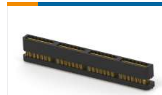
TE Part # 1658438-4 MSB0.80PL14ASY160FL,-,10,-TY