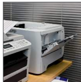
Copiers and Printers