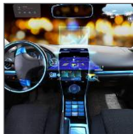
Automotive Interior Lighting and Sound System