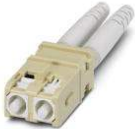
SC-RJ connector, with long bend protection, multi-mode 50/125 µm, beige, value pack: 10 pcs.

Please be informed that the data shown in this PDF Document is generated from our Online Catalog. Please find the complete data in the user's documentation. Our General Terms of Use for Downloads are valid ( http://phoenixcontact.com/download )