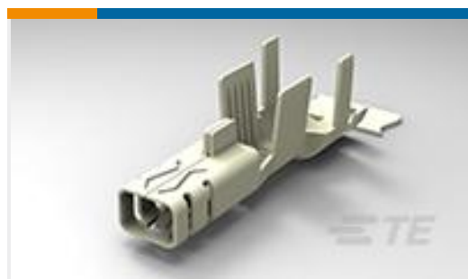
TE Part #1971787-2 PTL RECEPTACLE CONTACT, 2X18 AWG