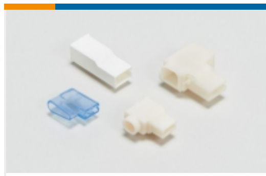
Crimp Terminal Housings(142)