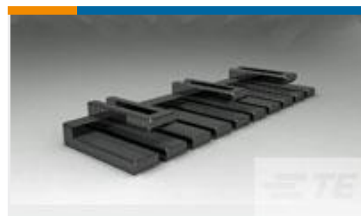
TE Part #1-1969443-0 EP 2.5 TPA Retainer, 10 Pos