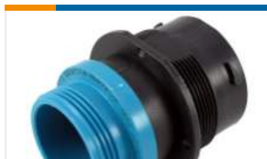
TE Part #HDP24-24-18PE-L015 REC, 18P, BLK, E, THD, 8/12/16, P