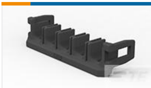
TE Part #1971777-5 PTL TPA HIGH TEMP 1 x 5 BLACK