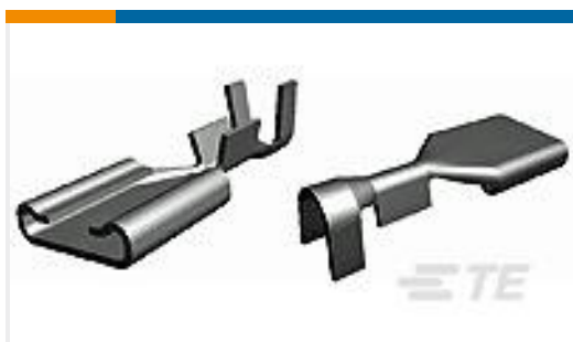
TE Part #42743-1 250 FASTON REC 22-18 AWG BR