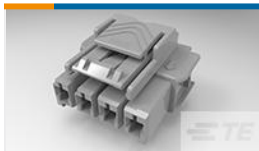
TE Part #5-1971773-4 PTL 1X4 PLUG HSG HIGH TEMP KEY A LGR