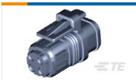
TE Part #1337352-1 E3 RECEPTACLE CONN. ASSY.