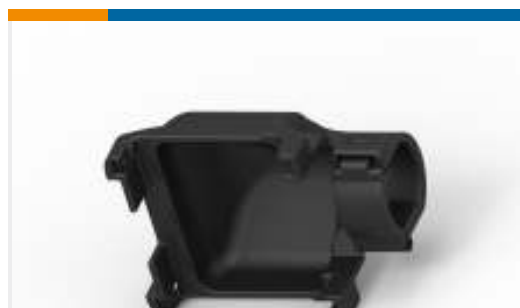
TE Part #776665-1 Wire Cover, V Type, 49 Position