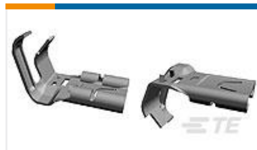
TE Part #63604-1 250 FASTON FLAG REC 18-12 AWG NPST