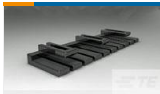
TE Part #1-1969443-4 EP 2.5 TPA Retainer, 14 Pos