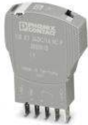
Electronic device circuit breaker, 1-pos., active current limitation, 1 N/C contact, plug for base element.

Please be informed that the data shown in this PDF Document is generated from our Online Catalog. Please find the complete data in the user's documentation. Our General Terms of Use for Downloads are valid ( http://download.phoenixcontact.com )