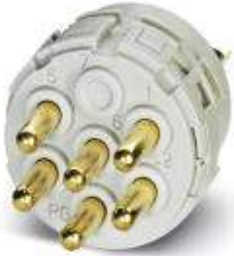
Contact insert, Number of positions: 6+3, Type of contact: Male connector, Solder connection

Please be informed that the data shown in this PDF Document is generated from our Online Catalog. Please find the complete data in the user's documentation. Our General Terms of Use for Downloads are valid ( http://phoenixcontact.com/download )