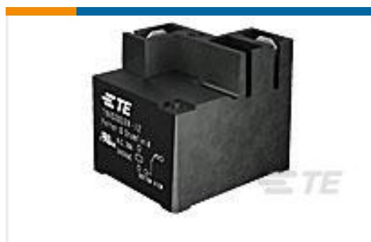
TE Part #6-1419102-3 T9AP1D52-24