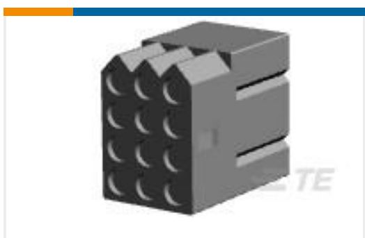
TE Part #770098-1 12P .093 COMM P&S RECPT