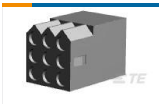
TE Part #770092-1 09P .093 COMM P&S RECPT HSG