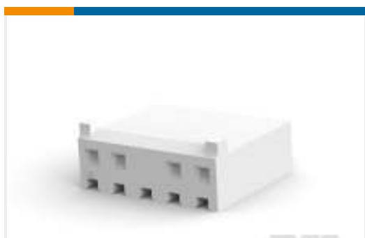
TE Part #640251-6 Receptacle Housing: Wire-to-Board, no Mating Alignment, SL 156