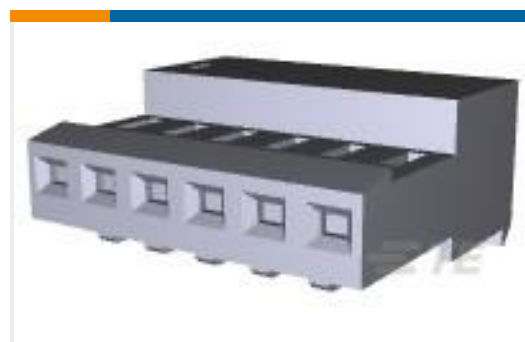
TE Part #3-640441-6 06P MTA100 CONN ASSY WHT