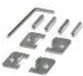
HMI mounting kit for installation on a front plate. The mounting kit includes 4 x mounting brackets, 4 x screw threads, and a hexagonal wrench.

Mounting material - HMI SCB MOUNTING KIT 4 - 2701384