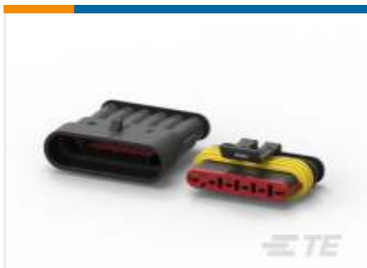
TE Part #282108-1 AMP SUPERSEAL 1.5MM, CONNECTOR HOUSING