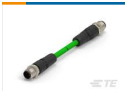
TE Part #TAD14741111-020 M12D4-MS-MS-PVC TYPE B-2.0M