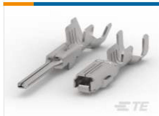
TE Part #183036-1 AMP SUPERSEAL 1.5MM, RECEPTACLE AND TAB