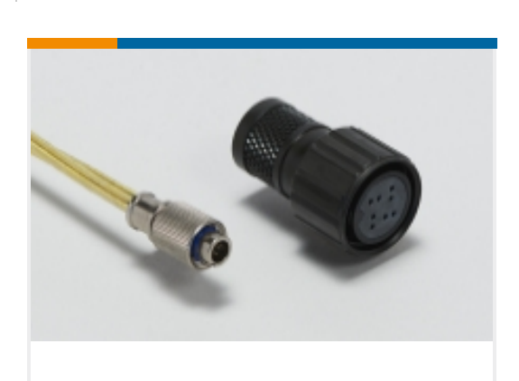
Standard Circular Connectors(521)