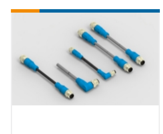
M8/M12 Cable Assemblies(230)