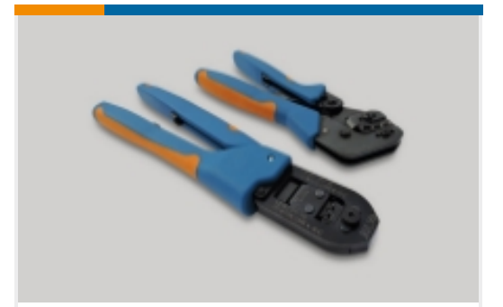
Hand Crimping Tools(32)